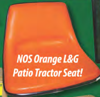
NOS Orange L&G Patio Tractor Seat!