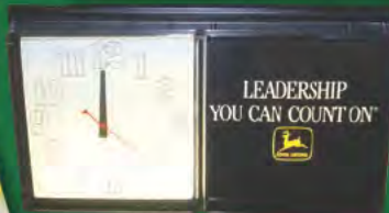
4-leg & 2-Leg Logo Signs, Clocks, Posters, Banners, Flags & Displays - even a 22' Long NOS L&G Billboard from 1985!