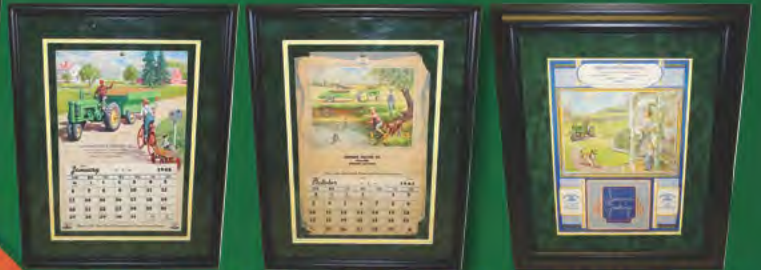
JD Calendar Collection—'32 West Point, NE; '36 Hilldale, IL; 1937 Large Centennial Calendar—NIB; '38 Fairmont/Sherburn, MN; '38 Cedar Rapids, IA; '43 Riverside, CA; '45 Humphrey, NE; 46 LaMoure, ND.