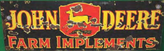
Rare 6'x2' Black Porcelain 4-leg Deer Sign—factory cut for neon!

We have been consigned several smaller dispersals from retired John Deere Corporate Employees and Dealers! Great variety of items—new & old!