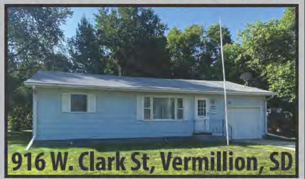
916 W. Clark St, Vermillion, SD