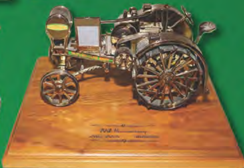
RARE JOHN DEERE TOYS including 4010 w/ GOLD ROPS '95 KC Safety Award, Gunmetal Chrome Waterloo Boy on Plaque 70th Anniv. Of Waterloo Works; Gunmetal Chrome 4520 ROPS Columbus OH; Gold D KC Branch; GOLD 80 Columbus Anniv.; 8960 4wd '88 Denver Ed.; 8400T Waterloo Works; and others; Also #3 Pedal Car, small Goat Wagon, US Mail Wagon, & Pedal Car Size Gas Pump!