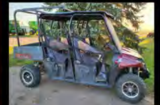
POLARIS RANGER – 2014 Polaris Ranger 570 Crew 4x4 6-Seat Side-by-Side; roof; full windshield; winch; utility rack; 5,975 miles; recent service work; runs good!