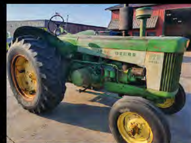
1959 JD 830 Diesel, electric start, PS, great original paint, SN#304965!