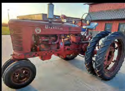
1952 IH Farmall Super M w/ Rare Factory Duals, 4-sets rear wheel weights, great original, runs good, SN#3234.