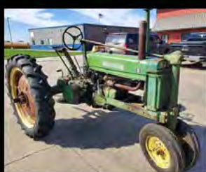
1937 JD Unstyled B on Rubber, runs good, SN#36613.