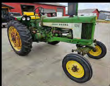
1960 JD 530, gas, square wide front, 3pt w/ center link, fenders, great original paint, SN#5309049.