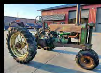
1938 JD Unstyled G on Round Spoke rear Rubber, runs, SN#1249.