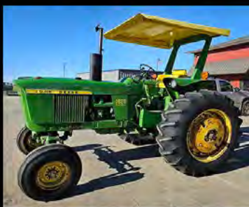
1972 JD 3020 w/ ROPS & Sunshade, Diesel, Syncro, wide front, fenders, 3pt with center link, good tires, shows 8,155 Hours, 2-sets rear wheel weights, Firestone 151 Rears 99%, very good original paint, SN#154657R.