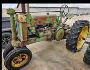
1935 JD Unstyled A on Round Spoke Rubber, loose, not running, #420033.