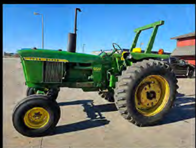
1972 JD 4020 w/ ROPS, Diesel, Syncro, wide front, Fenders, 3pt w/ center link, 3-sets rear wheel weights, Firestone 18.4x38 Rears, shows 6,386 Hours, great original paint, SN#268110R.

Featuring a collection of ORIGINAL PAINT TRACTORS!