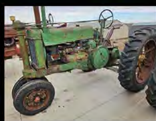
1935 JD Unstyled A on Cut-off rubber, Runs, SN#417732.