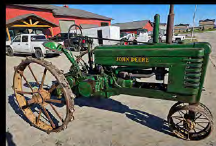
1943 JD Styled B on Steel, original, low-hour tractor, uncut hood, runs, SN#147420.