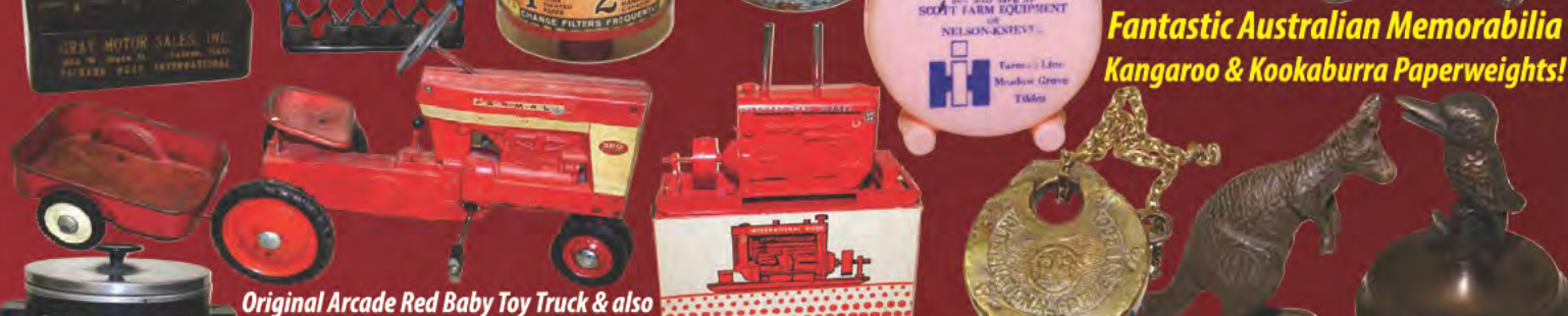
Original Arcade Red Baby Toy Truck & also an original 560 Pedal Tractor & Wagon!