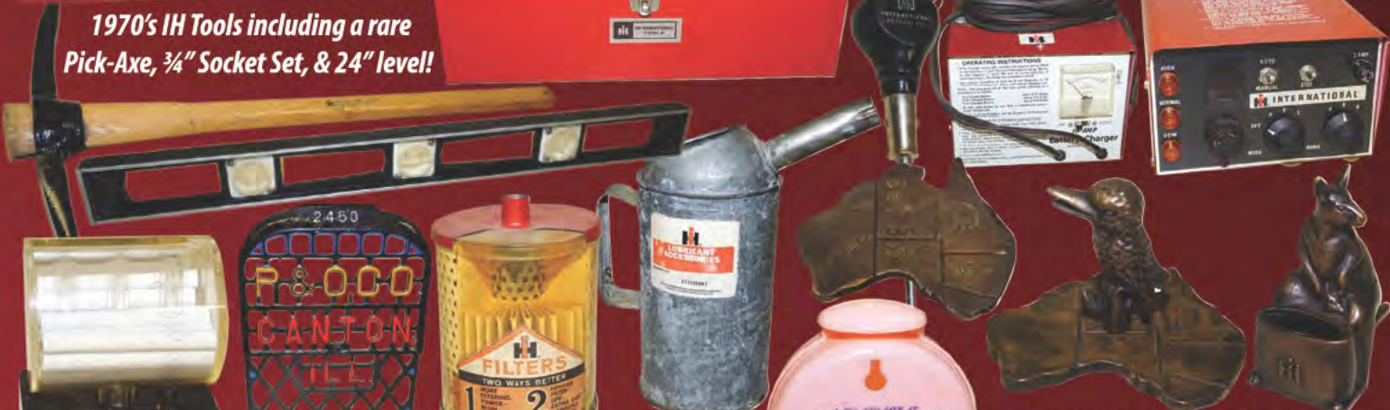
Fantastic Australian Memorabilia Kangaroo & Kookaburra Paperweights!