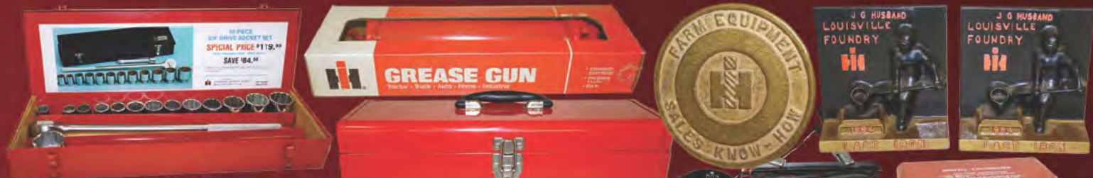
1970's IH Tools including a rare Pick-Axe, 3/4" Socket Set, & 24" level!