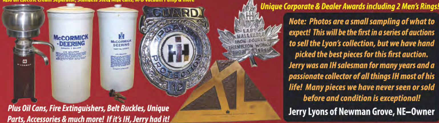
Unique Corporate & Dealer Awards including 2 Men's Rings!