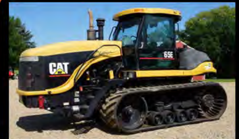
1998 CAT Challenger 65E, 4,652 hrs, CAT 3176 motor, 4-hyds, swinging drawbar, C-IH EZ Guide 250, SN# 6GS00291