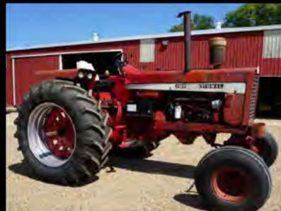
IH 1256 Diesel Turbo, 7,648 hrs, wf, dual pto, dual hyds, 18.4x38 rears-excellent!