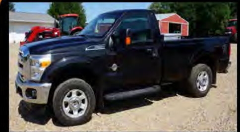
2013 Ford F-250, XLT, 4x4, 6.7 diesel, 51,400 miles, auto, 5th wheel, aluminum tool box.

Combine Heads/Head Carts: 2011 CIH 3206 corn head, hyd stripper plates, SN# YAS023214; 2008 CIH 1020 bean head, 25', full fingers, 3" cut, SN# CBJ044249; EZ Trail 672 20' head cart; EZ Trail 680 30' head cart.