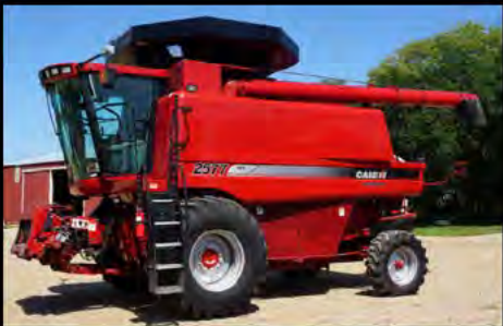
2008 Case IH 2577 Axial Flow Combine, 1,935 engine hrs, 1,392 sep hrs, Mauer grain ext, rear camera, CIH AFS Pro 600 monitor, rock trap, field tracker, SN# HAJ303823