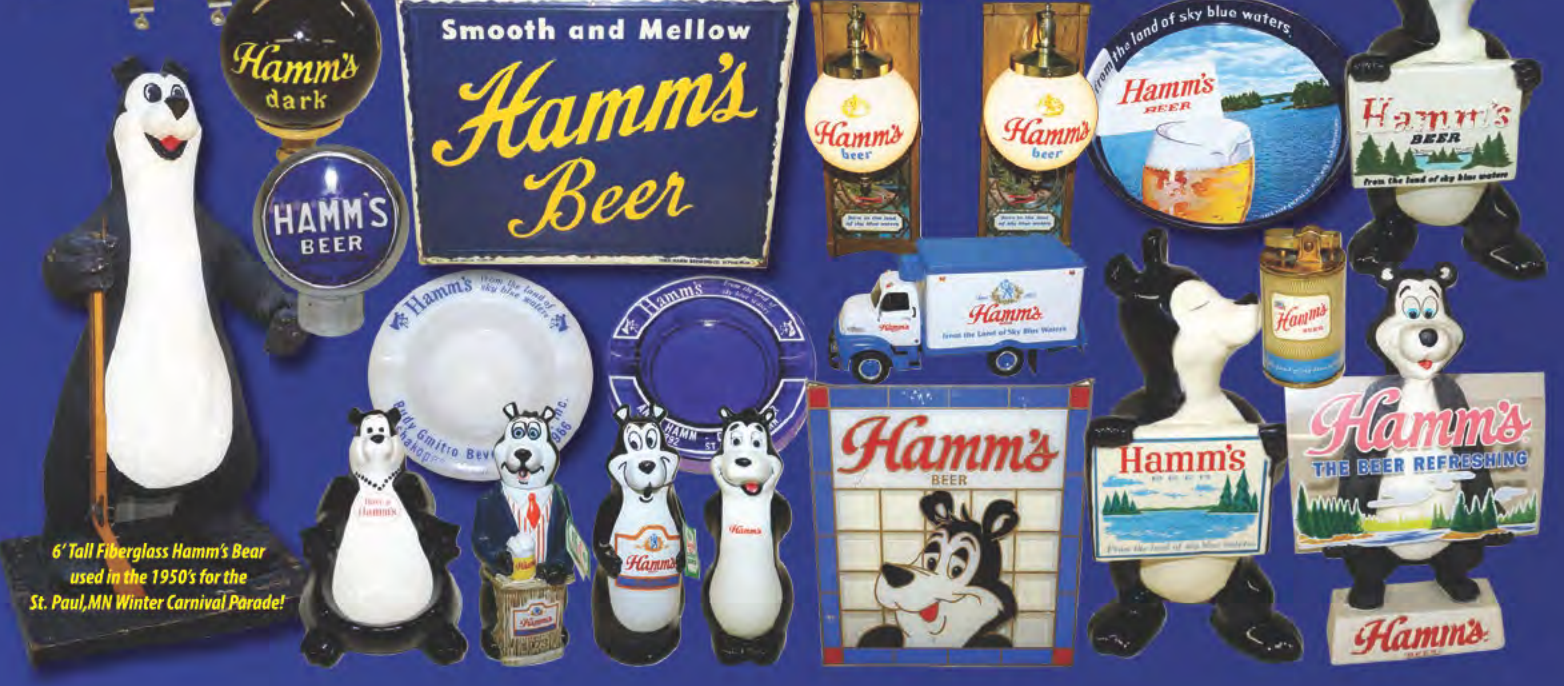
6' Tall Fiberglass Hamm's Bear used in the 1950's for the St. Paul, MN Winter Carnival Parade!

Motion Signs—Neon Signs—Lighted Signs—Displays—Metal Signs Coolers--Glassware—High-Quality Smalls & more!