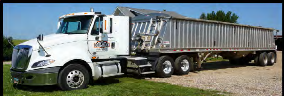
2011 International ProStar, 389K miles, MaxxForce Engine, Eaton 13 spd trans, new drive tires and rims; 2015 Dakota grain trailer, 41', aluminum, Shurco 4500HD electric tarp, 54" sides.

Harvest Equipment/Augers: J&M 875 grain cart, roll tarp, front unload, small 1000 pto, rear lights, 30.5x32 tires, SN# 4540; Brent 640 gravity wagon, Shur Lok roll tarp, lights, 445/65/22.5 tires, SN# 640299; Harvest International H1382 auger, swing hopper, 540 pto, nice; Agi Westfield WRX 10-31 auger-NEW, never used; Feterl 32' hyd truck auger.