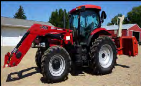
2009 Case IH Puma 115 w/ C-IH L760 loader, MFWD, 947 hrs, 540 pto, joystick controls, 3-hyds, excellent rubber, SN# Z9BL09862

This is an exceptionally clean & well maintained, complete line of farm equipment. Very little for small items sold during the live auction—be on time!