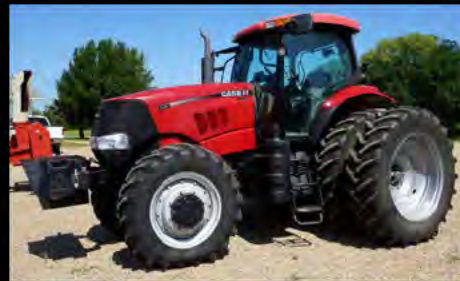
2007 Case IH Puma 165, MFWD, 1,522 hrs, 3-hyds, small 1000 pto, duals, excellent rubber, rock box w/ weights, Raven Auto Str, SN# Z7BH01293